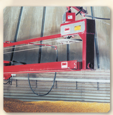
Design III & Red Giant