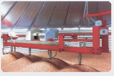
▲ Red Giant Stir-Ator with 4 Augers

The Red Giant Stir-Ator is a 4 or 6 auger stirring machine designed for drying bins using high heat and large airflows. The extra augers provide the additional stirring required with high drying rates.