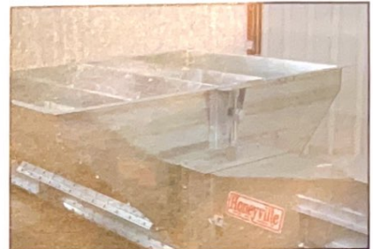
Simple to adjust flow control on pit hoppers