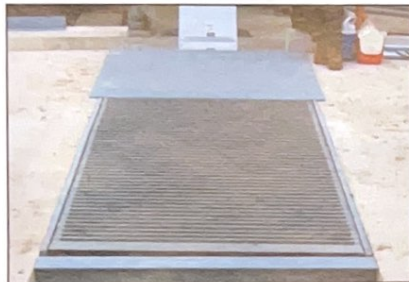
Drive-over pit hopper with bar grate provided in 12" wide lift-out sections for easy access